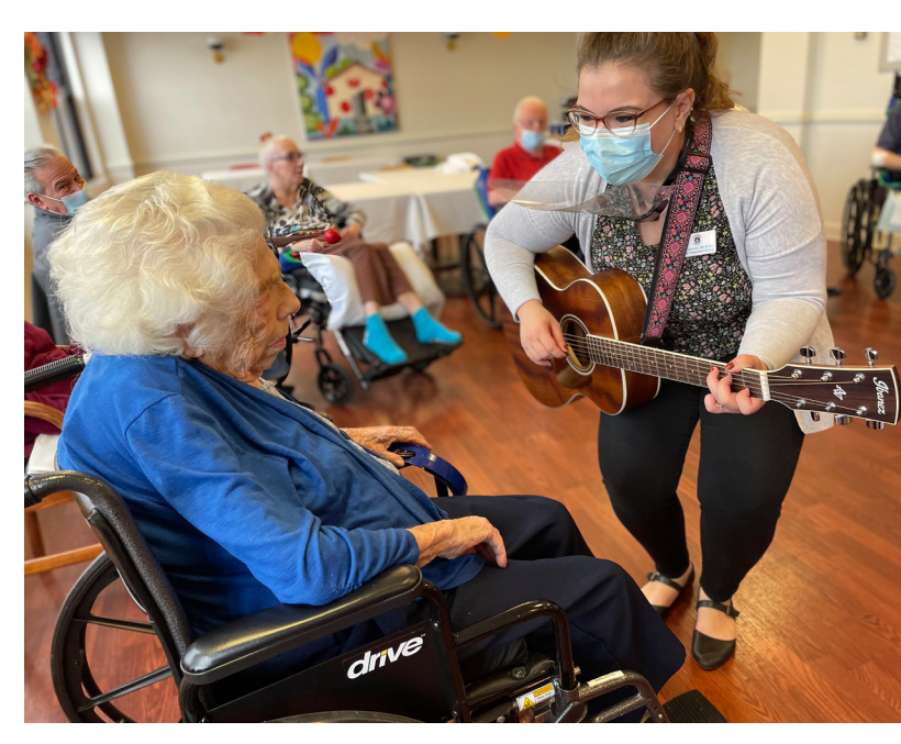
The Selfhelp Music Therapy Program includes both individual and group sessions with an initial focus dedicated to those dealing with cognitive impairments.